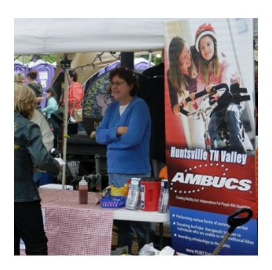
Pictured above: The Athens State University Student SHRM Chapter booth at the Fiddlers Convention at Athens State University.

The ASU SHRM Student Chapter teamed up with Porkalicious BBQ for the annual Fiddlers Convention Event on the ASU Campus on October 5-6th, 2012. It was a terrific opportunity to work with this vendor who used their portion of the proceeds of their event to donate to AMBUCS a non-profit agency that manufactures physical therapy bikes for disabled children and adults. Thanks to the support of our hardworking members and volunteers from our professional chapter, TVC-SHRM, our Student SHRM Chapter also raised about $2,000 during the event. These funds are being used to fund HR education workshops sponsored by the group. The SHRM Student Chapter also returned $100 of the profit from the event back to AMBUCS to fund the assembly of a bike for a disabled child or adult.