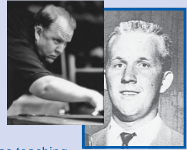
Steve Mizerak Class of '68 1944 - 2006

Mizerak transferred to Athens College for his senior year in 1967 and then became a teacher after graduation because the prize money in professional billiards was hardly spectacular at that time. In the mid-1970's, he was teaching spelling and geography to seventh graders but his fortunes changed a few years later when he appeared in a commercial. "Those 29 seconds changed my whole life," he once said of his first TV commercial.