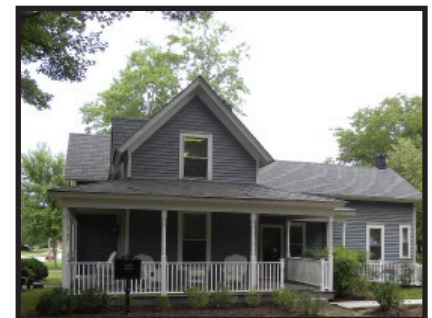
433 East Pryor Street