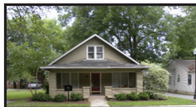
413 Hargrove Street