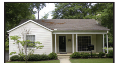
415 Hargrove Street