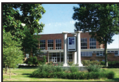
Carter PE Center