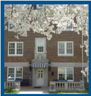
Sanders Hall, College of Business